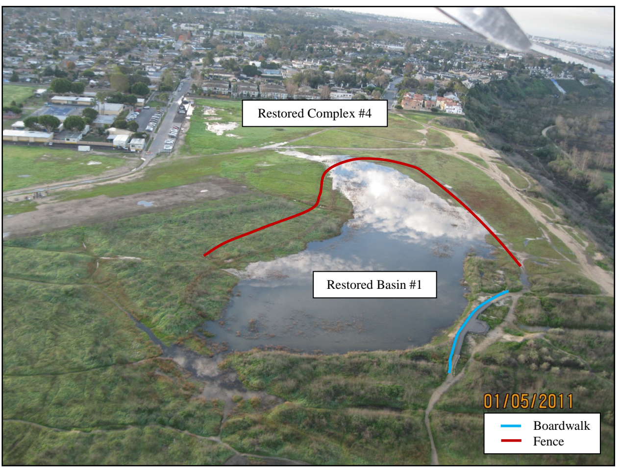
Figure 2. Vernal pools in Fairview Park during an above average rainfall year (facing south). Paths bisect the basins in several locations, and the fencing is in the water. Labels added.

In above average rainfall years, it is likely that the watersheds of Restored Basin 1 and Restored Complex 4 are connected across the path that artificially separates the watersheds (Figure 2). It is also likely that Basins 5, 6, and 7 are part of a vernal pool complex with a shared hydrological connection during high rainfall years. Monitoring during previous restoration efforts identified the connection between Basins 5 and 6 (Michael Brandman Associates 2002), and the boundary between the watersheds of Basin 5 and 7 was coincident with a row of logs that have since been removed (Finium Environmental 2013).